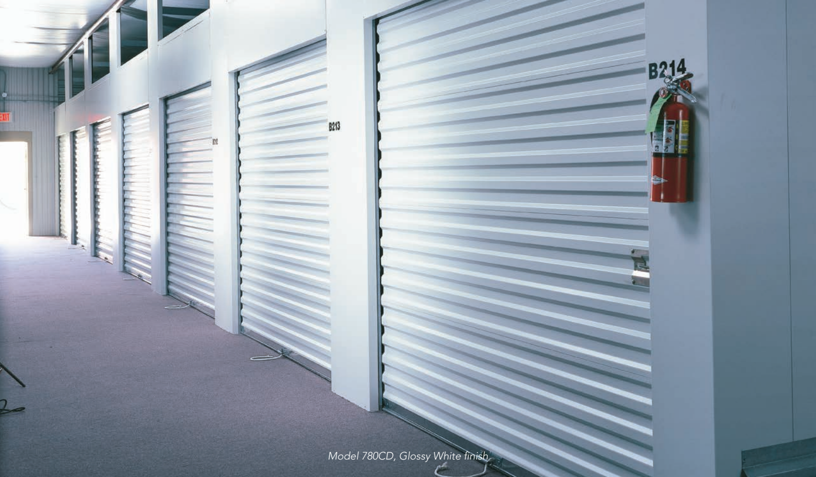
Model 780CD, Glossy White finish